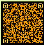
QR for Google Form

Registration can be done using Google form and payment should be made using www.entosocindia.org or using QR code -