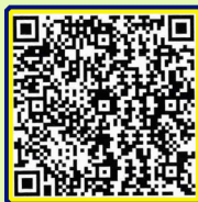
QR for Payment